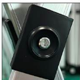
CURVED TRUSS BARS