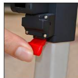
PUSH BUTTON HEIGHT ADJUSTMENT