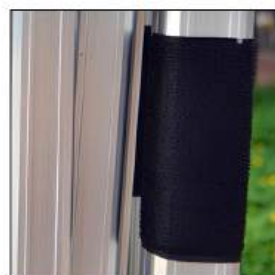
ROOF FABRIC STICKER