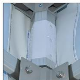
ROOF FABRIC STICKER