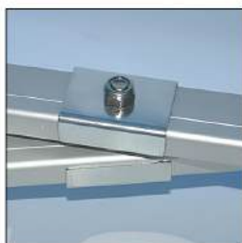
CURVED TRUSS BARS