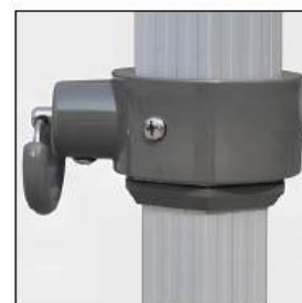
PUSH BUTTON HEIGHT ADJUSTMENT